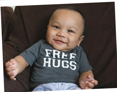
Mason Kekoa Scholarship Fund

Established in 2013, our Cooling Cancer Non-Profit Organization raises money for cancer patients and research in Hawaii. To date, we have donated over $340,000 to the University of Hawaii Cancer Center. We are passionate about our mission to eradicate cancer during our lifetimes and ask for your support. LEARN MORE AND GET INVOLVED online at coolingcancer.org