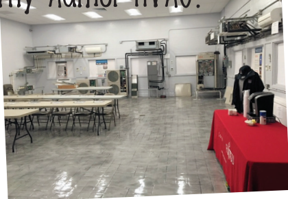
State-Of-The Art Hands On Training Center

Our State-of-the-art Training Center represents an investment in Hawaii Contractors and provides a "hands on" learning experience with fully operating ducted, ductless, multi-zone and VRF systems. We strongly believe that training is an important part of our mission and goal to provide the highest level of service before, during and after the sale. Investing in our customers and Hawaii's HVAC industry is important to Admor HVAC.